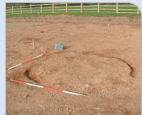
Circular structure uncovered during excavations at Coolbeg .

Specialist examination and study of the excavation archive is on-going, including artefact and environmental analysis and radiocarbon dating along with processing of site plans, mapping, photography and written documentation of the sites. This post-excavation phase of the works will result in the compilation of preliminary and final excavation reports, which in turn will lead into full publication of the excavation results.