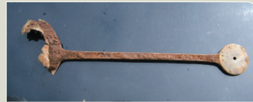
Back view of bronze ladle or patera found at Ballynapark .

The present find was embedded into the upper surface of a light grey coloured marl that directly underlay boggy ground. Though the ladle was located close to the burnt spread of a fulacht fiadh , it was not