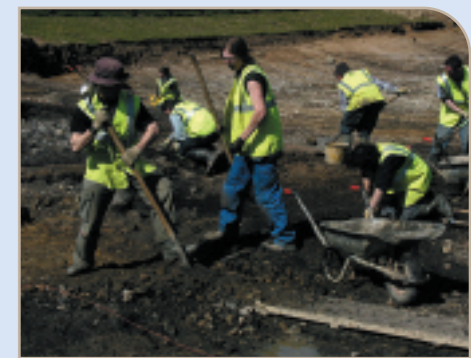
Archaeologists excavating a site along the scheme.