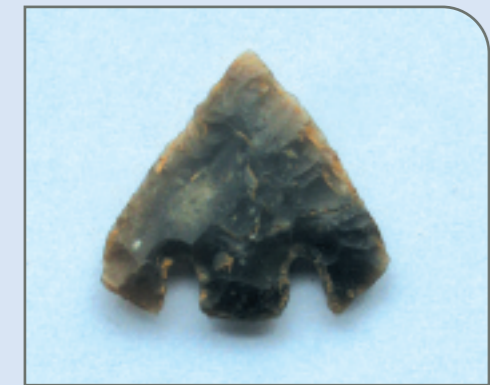
Barbed and tanged arrowhead found at Coolbeg.

The earliest settlement evidence along the route relates to a Recorded Monument in Coolbeg townland and consisted of a flint scatter, part of which lies within the area of the roadtake. Flints had been recovered from field-walking carried out as part of the Environmental Impact Assessment for the scheme as well as from earlier field-walking episodes. Investigations at this site continued through the present test-excavation and resolution phases. The flints from initial studies seem to range in date from Mesolithic, through to Neolithic and Bronze Age times. They demonstrate the presence within the area of a