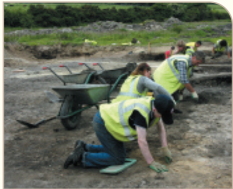
Archaeologists excavating fulacht fiadh at Ballyclogh North .

Neolithic pottery was recovered from post-holes to the north-west of a fulacht fiadh in Ballyvaltron and may represent the truncated remains of another house structure. Hearths, pits and post-holes together with prehistoric pottery, some decorated, supplied evidence of Bronze Age settlement at sites in Coolcork and Ballinaclough .