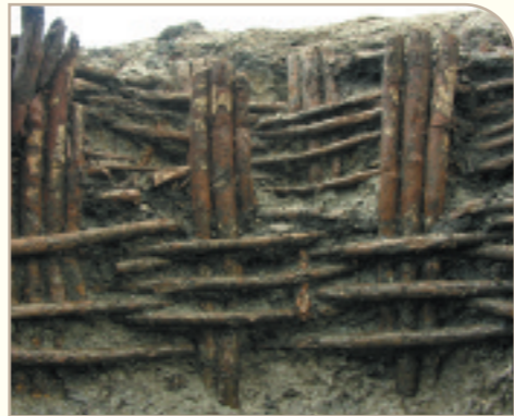
Close up of wicker lined trough uncovered at Ballyclogh North .

Many of the excavated fulachta fiadh incorporated fine, timber-lined, cooking troughs. Some of the timber linings have already been analysed as being of alder. At Ballyclogh North , a timber platform was present, consisting of nine split-oak planks held in place by pegs.