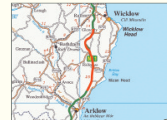
© Ordnance Survey Ireland & Government of Ireland permit number EN 0045206.