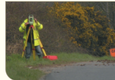
Archaeologist carrying out surveying on the scheme.

Extensive geophysical surveys conducted along the route by Earthsound Archaeological Geophysics and Substara Ltd , were closely followed by the excavation of centerline and offset test-trenches. During this work in June and July 2005, 61 sites were identified by the geophysical survey and test-trenching works and were recommended for resolution through excavation.