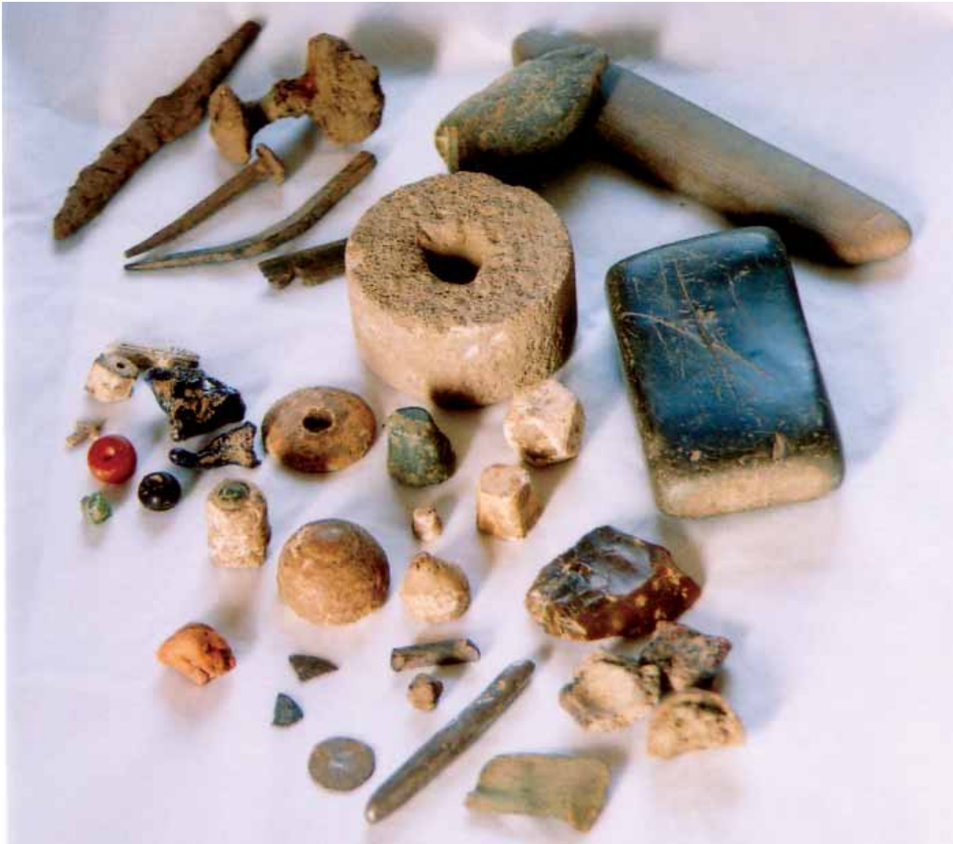
Illus. 1—A selection of stone, glass, bone, metal and glass artefacts recovered from Woodstown 6