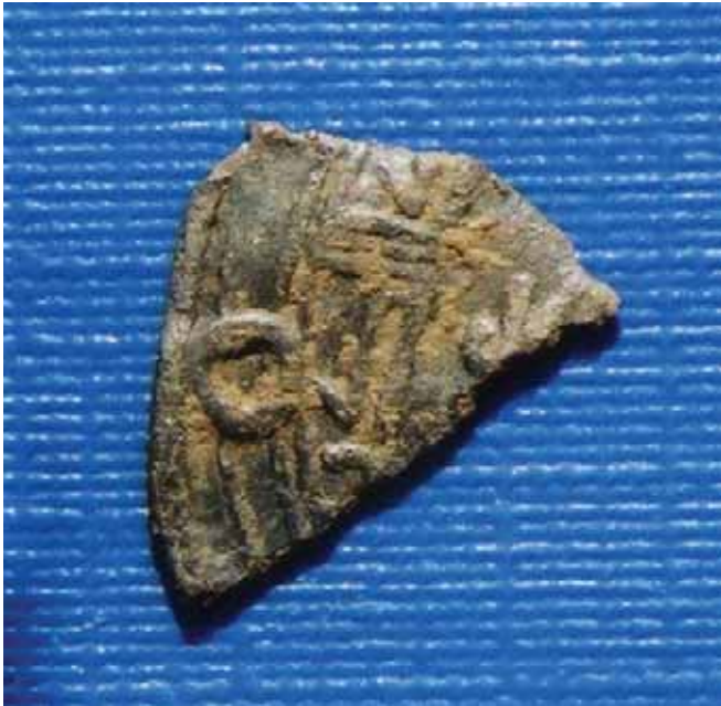
Illus. 4.—Fragment of a silver Kufic coin, which measures 9 mm by 7 mm by 1 mm (Archaeological Consultancy Services Ltd)