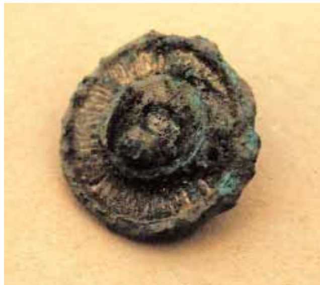
Illus. 5—Copper-alloy stud mount (30 mm in diameter) with gold foil (Studio Lab)

5) may also have come originally from a house shrine. All of these objects are interpreted as fragments of sacred books or objects of early medieval date. Either the pre-Viking site at Woodstown was an Irish monastery or these fragments represent objects brought from elsewhere to the Viking settlement, either as loot or tribute.