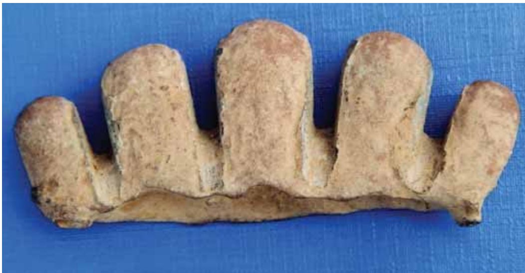
Illus. 2—Viking-type five-lobed sword pommel, which measures 67 mm by 27 mm by 42 mm