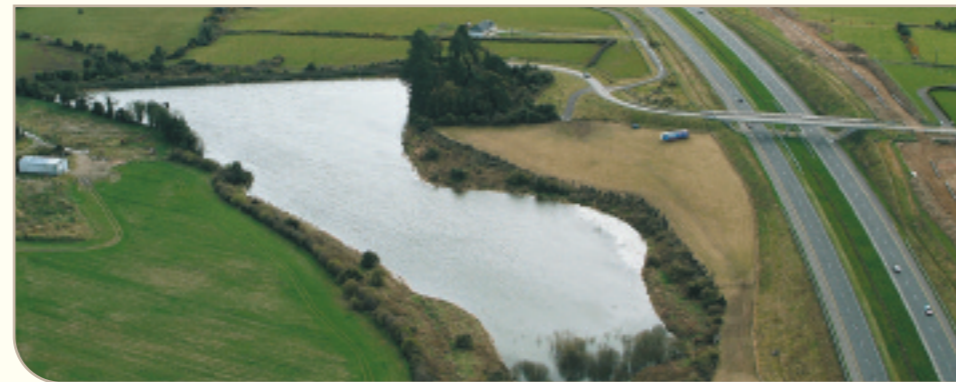
Aerial view of Balgatheran Lake and the completed motorway.

The M1 Drogheda Bypass is 21 km long, crossing the Boyne Valley to the west of the town of Drogheda where it forms part of the motorway between Dublin and Belfast .