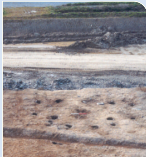
Circular Neolithic building recorded at Balgatheran .