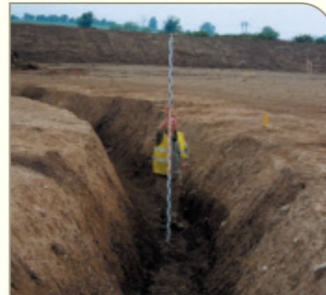
Bronze Age enclosure ditch excavated at Sheephouse .

Possible ring-barrows were also found at Sheephouse and there were ten burnt mounds uncovered to the south of the River Boyne.