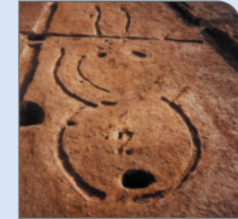
Early medieval conjoined post-hole building discovered at Platin .

Five sites in Mell , Hill of Rath and Balgatheran all appear to show a unified rectilinear field system containing numerous dispersed buildings, stock enclosures, small 'booley'/shepherding huts and considerable evidence for metal working. There are no ringforts but there was a large 35 m long souterrain discovered at Mell. The souterrain incorporated a constriction and a drain and ended in a circular corbelled chamber. The impression is that this whole area may have formed part of an estate connected to the ecclesiastical centre at Monasterboice .