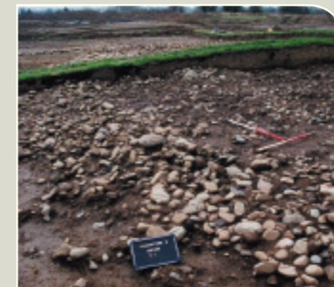
Close up of ring-cairn uncovered at Claristown .

A second group of four graves, dating from the fifth to seventh century AD were set 10 m to the south of the cairn.