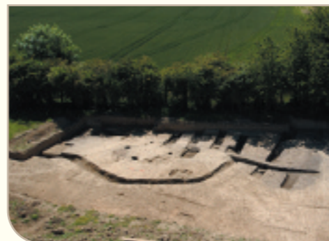
Elevated view of sweat lodge at Rath .

Since May 2006, commuters and residents have been enjoying the benefits of the new 17 km road which extends from the M50 junction at Finglas and bypasses the town of Ashbourne along its western side before rejoining the old N2 just north of the town.