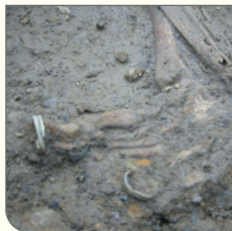
Detail of toe ring burial at Rath.

To date, there is little comparative data from other Irish burials. However, the results were consistent with origins on the limestone in eastern Ireland and suggest that the woman from Rath probably originated in the area where she was buried.