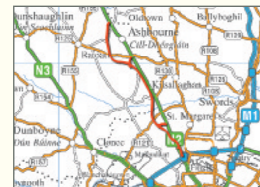
© Ordnance Survey Ireland & Government of Ireland permit number EN0045206.