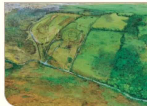
Reconstruction of Raystown c. AD 900. (Figure Simon Dick for CRDS Ltd)