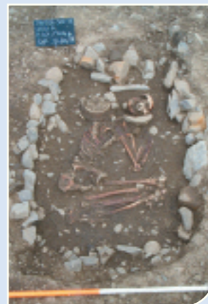
Burial with food vessel uncovered at Harlockstown .

Specialists identified some Early Bronze Age Beaker pottery from the site. Beaker culture in Ireland is directly associated with the new technology of copper working. Iron Age activity on the site included an extensive metalworking phase within a rectangular enclosure and a small poorly-preserved burial ring-ditch.