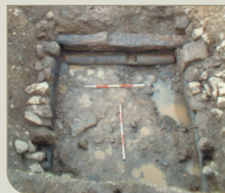
Northern mill 2 at Raystown under excavation.

93 people, mostly adults were buried here. The careful analysis by an osteoarchaeologist has shed light on the lives of the community.