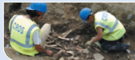
Archaeologists excavating animal bone layer at Kilshane Neolithic enclosure.

Given the nature of the deposit and the timing of the event, it is tempting to speculate that the animals were offered up in gratitude for a good autumn harvest or in appeasement after a bad one.