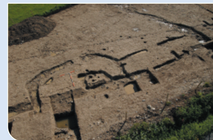
Aerial view of row of medieval houses including forge at Cookstown .

The medieval period in the area is well represented by high status, defensive mottes and castles, but the evidence at Cookstown augments this picture with evidence for a rural settlement community.