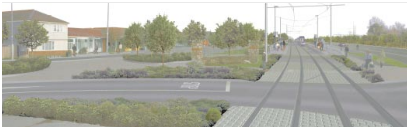
Proposed Luas Line B1 Stop at Leopardstown Valley

The proposed Line B1 alignment will run from the Sandyford Stop at the north-eastern corner of the Sandyford Industrial Estate, across the lands at Central Park and the South Eastern Motorway (SEM), before following the alignment of the planned Murphystown Parallel Access Road and Ballyogan Road, crossing the SEM and running along the former Harcourt Street Railway alignment at Carrickmines. At Brennanstown, it runs through lands at Laughanstown, and beyond to Cherrywood and Bride's Glen.