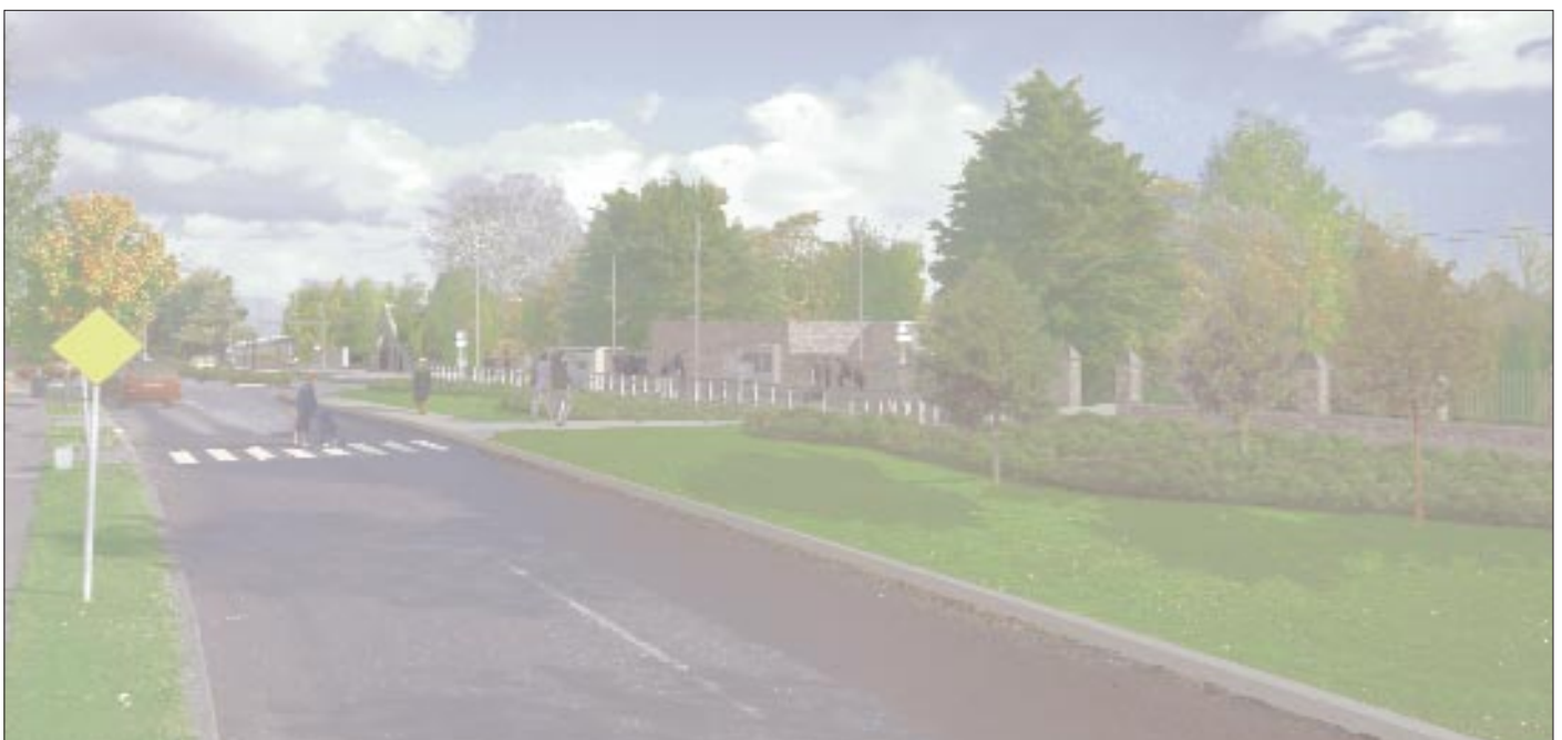
Luas Line B1 Glenacairn Stop

At each and every step of the consultation process it was made clear that the RPA was ready and willing to consult with interested parties in an open and professional manner. The process of consultation is ongoing and has served to confirm the generally positive acceptance and enthusiasm for the establishment of Luas Line B1 and the Luas in general.