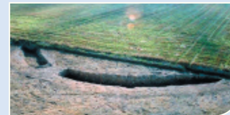
Ditch of the ring-ditch uncovered at Skahanagh North .

At Corrin , a similar ring-ditch with a causewayed enclosure was partially exposed within the excavation area. The ditch was U-shaped in profile