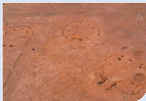
Three Bronze Age houses uncovered at Ballybrowney Lower .

At Rath-Healy , a concentration of pits and post-holes were revealed. Based on the evidence, the site may have been used as a working area, associated with a nearby domestic settlement. A range of finds were recovered, including four sherds of Bronze Age pottery, several pieces of flint, three flint tools, a flint javelin and a smoothing stone. The site produced a date range of 1950-1930 BC and 1970-1190 BC.