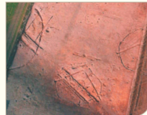
Aerial view of the multi-period settlement uncovered at Ballybrowney Lower .