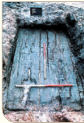
Timber-lined trough from a fulacht fiadh uncovered at Fermoy .

Twelve other fulachta fiadh or burnt mounds were identified across the scheme. Fulachta fiadh are believed to have been cooking sites predominantly of Bronze Age date but some Neolithic examples are known. These sites derive from a process of using heated stones to heat water. What the heated water was used for is still unclear. Processes such as cooking, dyeing, processing hides, bathing, sweating, ceremonial cleansing or fermentation have been suggested.