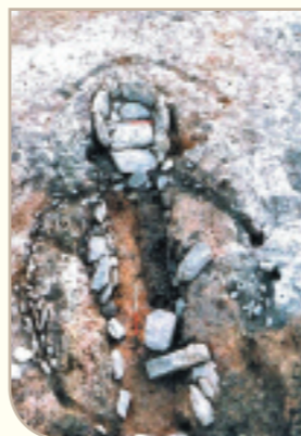
Fulacht fiadh with hut structure uncovered at Scartbarry .