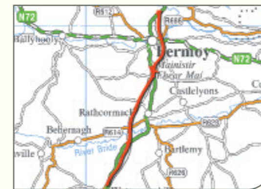
© Ordnance Survey Ireland & Government of Ireland permit number 8067.