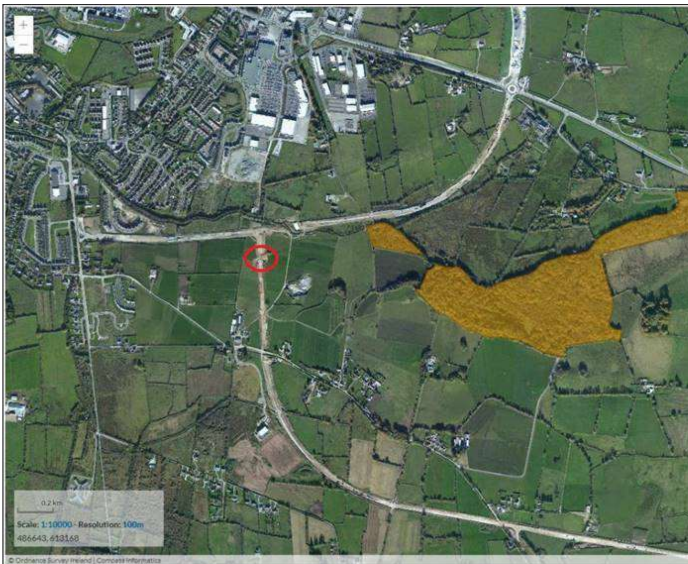
Figure 1. Site Location.

In accordance with the Munster Bridge Term Maintenance Contract No. 3, the Contractor appointed to Munster bridges has been asked to undertake Reactive Maintenance works to Ballyseedy Stock Underpass KY-N22-001.00. This is a dry underpass crossing under the N22 to the east of Tralee, Co. Kerry; just south of the junction with the N70.