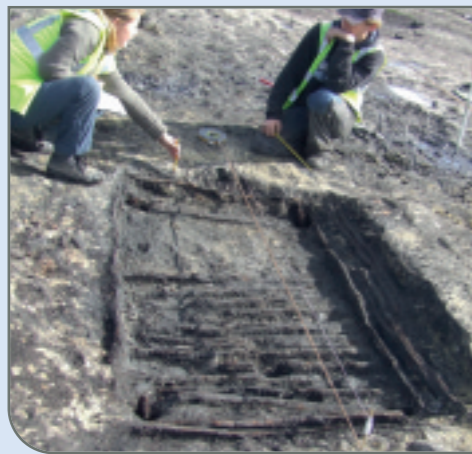
Recording of timber trough at Islands , Co. Kilkenny.

A roundhouse (6 m in diameter) was discovered in Fennor , South Tipperary. Fifteen sherds of Bronze Age pottery, including two decorated sherds, were retrieved from a single post-hole, one of a pair defining the probable entrance. A flint scraper and three other stone tools were retrieved in the vicinity of the house.