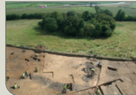
Grain-drying kiln at Gortmakellis , enclosed by ditches, in the environs of an overgrown ringfort.

In turn, the ringfort was cut by the construction of a large sub-rectangular ditched enclosure (65 m wide and 50 m long). This enclosure entirely enclosed both earlier enclosures and geophysical survey suggests that its construction was part of an extensive re-organisation of the agricultural landscape in this area.