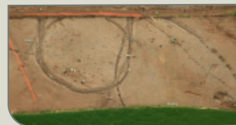
Enclosure complex, Borris Townland

This early enclosure was replaced by a ringfort that was defined by a circular ditch (32 m in diameter) with a north-east-facing entrance. Numerous features were present in the interior of the ringfort including four roundhouses defined by post-holes, curvilinear wall slots and drainage gullies. A bowl furnace and a number of shallow pits, one of which contained an iron knife and a pair of whetstones, were also found. The ditch fills contained animal bone, several iron knives, a glass bead, a bone comb fragment, a rotary quern-stone fragment, several bone pins, a stone gaming board and metallurgical waste.