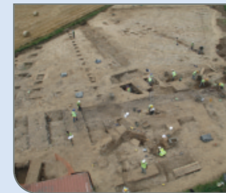
Archaeologists excavating late medieval and post-medieval ditches and pathway.

A post-medieval lime kiln was also excavated at Borris . These structures are found dotted throughout the landscape and were used for calcinating broken limestone to make powdered lime for use in industry, construction and agriculture and generally date from the 18th and 19th centuries.