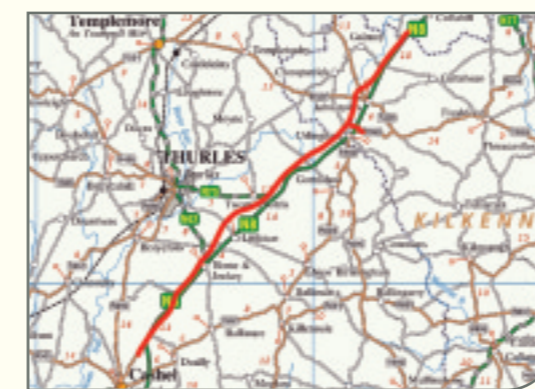
© Ordnance Survey Ireland & Government of Ireland permit number EN0045206.