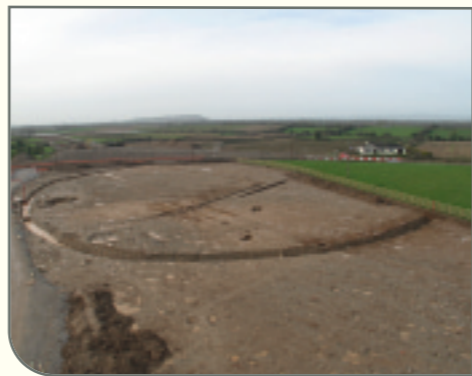
Oval ditched enclosure at Ballydavid .

Two Bronze Age pit cremation cemeteries were found on two adjacent ridges in Borris close to Twomileborris, the easterly one comprised 18 pits containing deposits of cremated bone while the other one comprised nine pits containing cremated bone and 12 pits which had no cremated bone. Downslope from the latter site (and close to the roundhouse described above) two circular ring-ditches were excavated, they were both just under 5 m in diameter. The fill of their shallow ditches contained small quantities of cremated bone and charcoal. A third sub-rectangular ring-ditch was found nearby. It enclosed a central cremation pit.