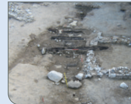
The remains of a medieval vertical watermill at Borris Townland .

A post-medieval lime kiln was also excavated at Borris . These structures are found dotted throughout the landscape and were used for calcinating broken limestone to make powdered lime for use in industry, construction and agriculture and generally date from the 18th and 19th centuries.