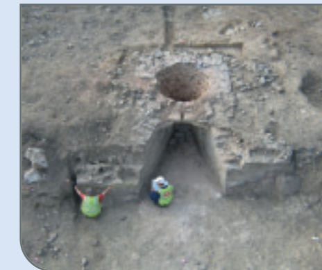
Recording of lime kiln at Borris .

Excavations to the south of the village uncovered extensive prehistoric and early medieval remains (see above). Activity contemporary with the late medieval borough was also found. These comprise a series of parallel ditches, which probably defined individual property boundaries, a large stone-lined keyhole-shaped grain-drying kiln and a complex of iron-working furnaces and hearths. A pit containing 61 silver coins of probable 14th-century date was also discovered. The remains of a medieval vertical watermill were found on the east bank of the Black River. On the opposite bank the foundations of a small rectangular (7 m by 6 m) earthen-walled building were uncovered. The building had a number of phases of use the latest of which was as a smithy.