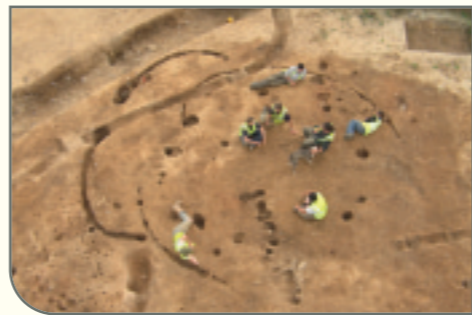
Bronze Age house at Borris post-excitation. Members of the excavation team demonstrate how the house could comfortably accommodate seven people (and a dog).

Another large ditched enclosure was identified on low-lying ground in Borris , adjacent to Twomileborris. It measured approximately 100 m in diameter. Access to the interior of the enclosure was by way of a narrow east-facing entrance flanked by a pair of post-holes. A fragment of human skull was found in the base of the ditch to the north of the entrance. A cluster of six pits and 12 post-holes was revealed in the centre of the enclosure. Two cremation burials, a pit containing stake-holes and a deposit of cattle bones were also found within the enclosure.