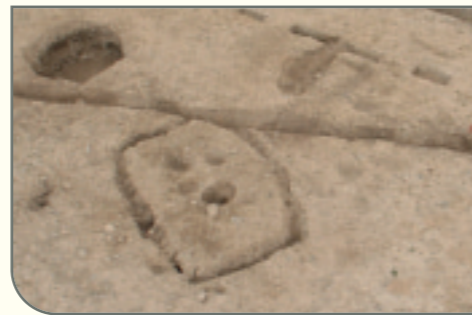
Sub-rectangular ring-ditch at Borris .

Another roundhouse excavated in Borris was defined by a curvilinear wall slot (6.5 m in diameter), it had an east-facing entrance with an annex or porch feature. The location of internal roof supports was indicated by