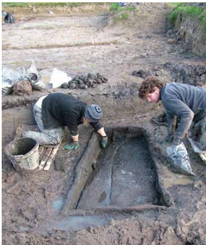
Illus. 2—Archaeologists excavating the trough of a fulacht fiadh/burnt mound uncovered at Newrath, Co. Kilkenny, on the route of the N25 Waterford City Bypass (James Eogan).