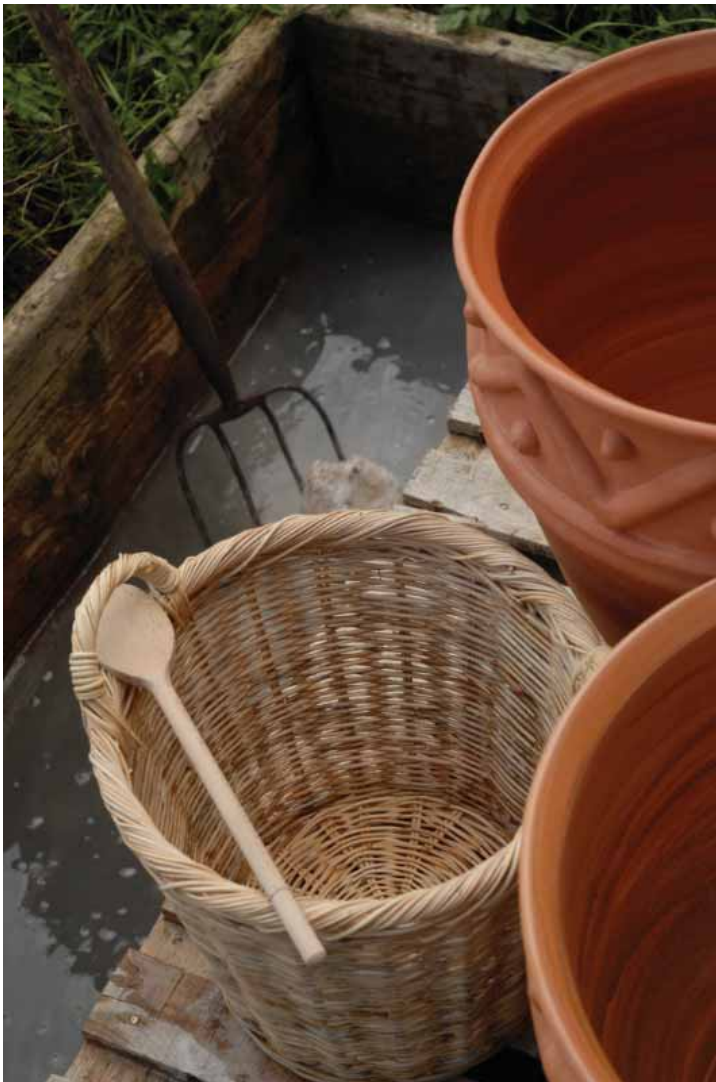
Illus. 3—Basic equipment; note the Bronze Age replica urn-style pottery vessels (Moore Group).

then dropping them into a water vessel. In a brewing context this process became known in Germany as ' stein beer ' (stone beer). Indeed, up until recently Rauchenfels Brewery in Marktoberdorf, Bavaria, revived this tradition by using heated graywacke to make their own distinctive beer. This dark sandstone resists shattering under the stress of superheating and is quick to cool—ideal for brewing. A beer reviewer had this to say about their product: