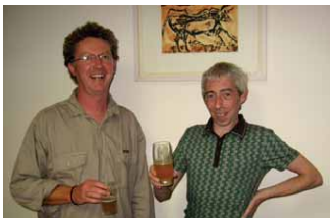
Illus. 9—The authors enjoying the fruits (Moore Group).