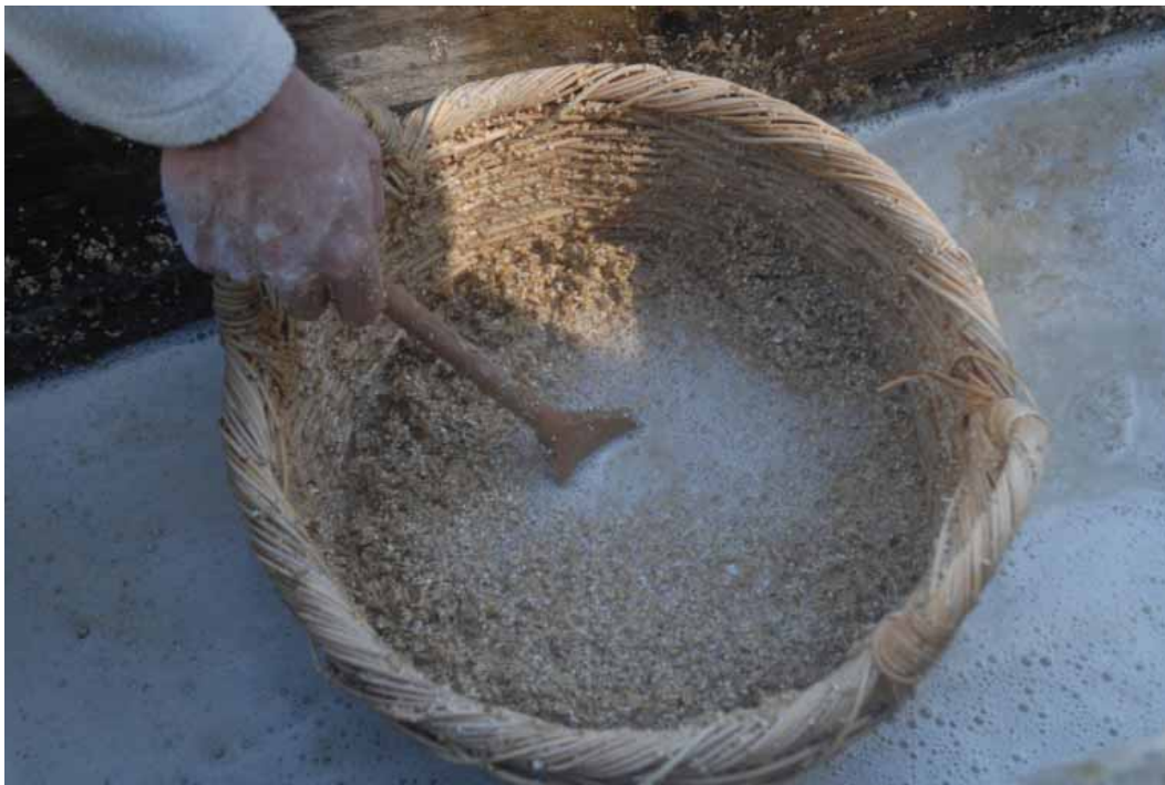
Illus. 5—Mashing the malted barley through a wicker basket (Moore Group).

Echoing the role of airborne yeast, the Norse sagas have it that Odin (the chief god in Norse paganism) disguised himself as an eagle and spilled the secret of beer from the sky ( www.beerhunter.com/documents/19133-000103.html , accessed April 2007). Furthermore, in Scandinavia and the Orkneys there is a tradition that early brewers realised that by reusing a stick with which they had stirred previous brews they could activate fermentation in subsequent worts; such sticks thus became valued items, and it was not uncommon for them to be willed from one generation to the next. One can imagine that