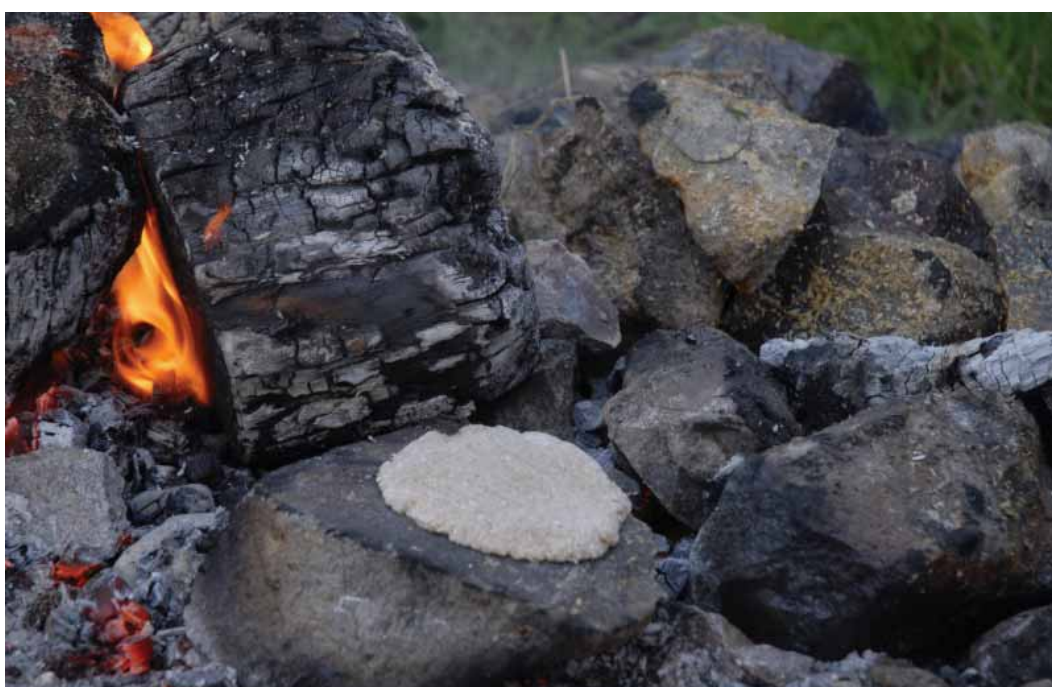
Illus. 10—A malt loaf being made from the spent grain (Moore Group).

grain, even after mashing, had its uses and would not have been dumped; rather it was treated as a valuable resource and may have been recycled to make bread or, as brewers do to the present day, given to animals as fodder.