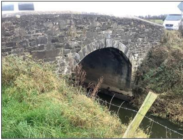
Figure 1. Mullaveagh Bride.