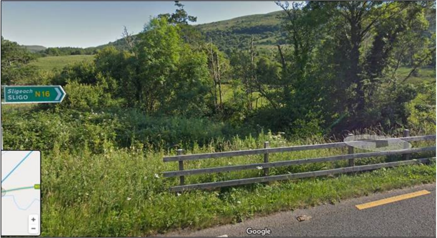
Diffreen Bridge Downstream