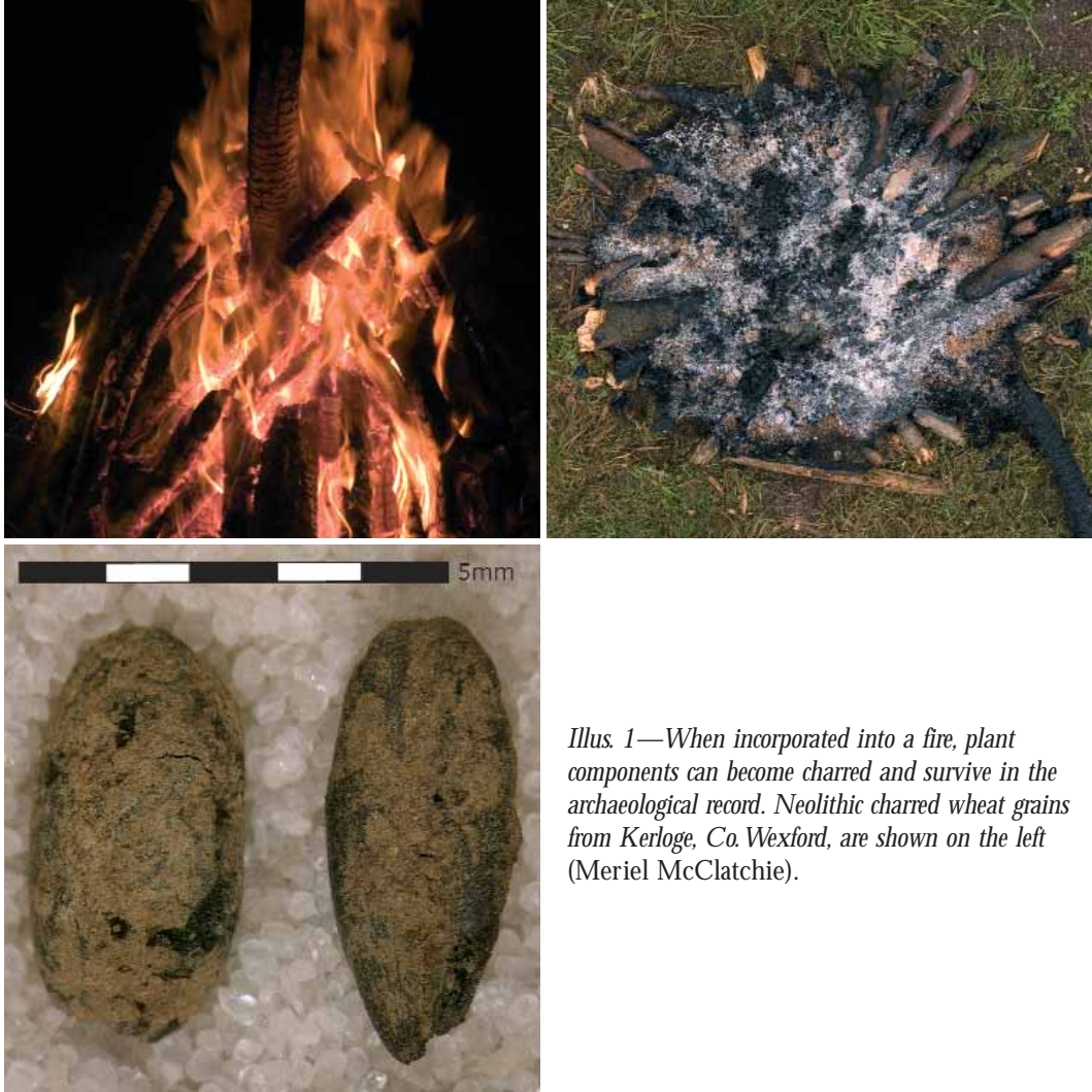
Illus. 1—When incorporated into a fire, plant components can become charred and survive in the archaeological record. Neolithic charred wheat grains from Kerloge, Co. Wexford, are shown on the left.