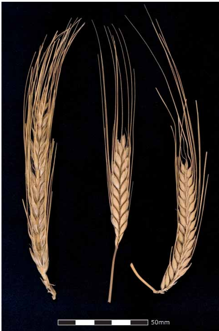
Illus. 2—Left: six-row hulled barley; middle: emmer wheat; right: two-row hulled barley (Meriel McClatchie).

Wheat also can be divided into hulled and naked varieties. Like barley, when wheat is hulled the husks are fused to the grain. With naked wheat the grain is more easily released. Hulled wheats—including emmer and spelt wheat—are rarely grown today and are often viewed as ‘ancient’ crop types. In recent years, however, spelt wheat has enjoyed something of a revival. Naked wheats—including bread wheat—are sometimes thought to be more modern than hulled wheats. It should, however, be noted that evidence for naked wheats has been recorded, albeit in small quantities, from Neolithic Ireland (for example Groenman van Waateringe 1984, 327), while substantial deposits of naked wheat were recorded at a Neolithic structure in Balbridie, Scotland (Fairweather & Ralston 1993).