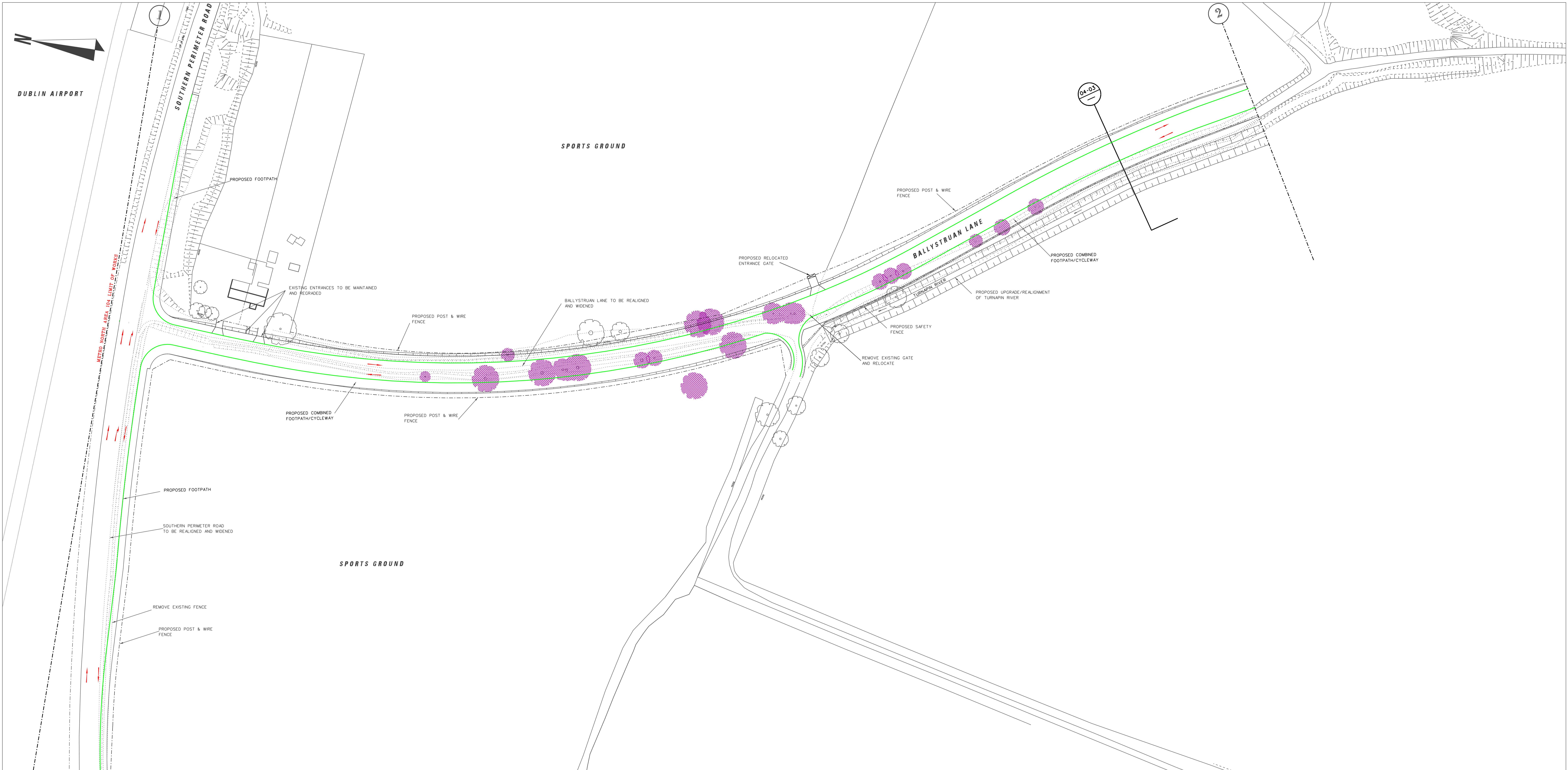
PLAN SCALE 1:500