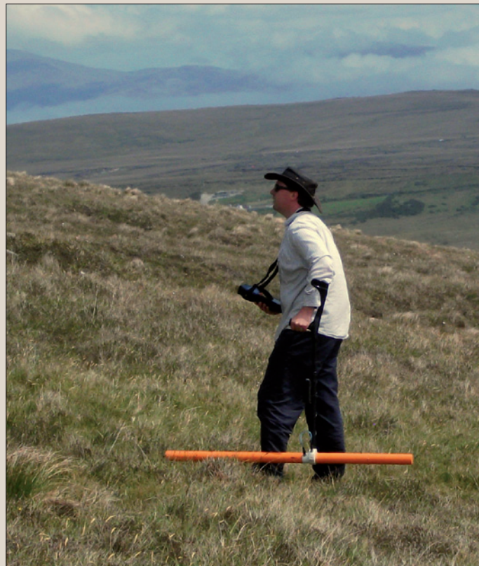
The latest technology—in this case a new electromagnetic device—being used by the author to assess its suitability for road schemes.

As well as reviewing the legacy data from the last decade, the NRA Fellowship Programme has also collected new data. This includes 35 new geophysical surveys across the country to investigate the effect of variables such as climate, geology and landscapes upon archaeological features. We are also assessing the very latest in geophysical technology. The fieldwork has given NRA archaeologists the opportunity to assist in and observe geophysical surveys as well as learning about the latest developments and instruments.