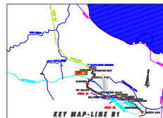
KEY MAP-LINE B1