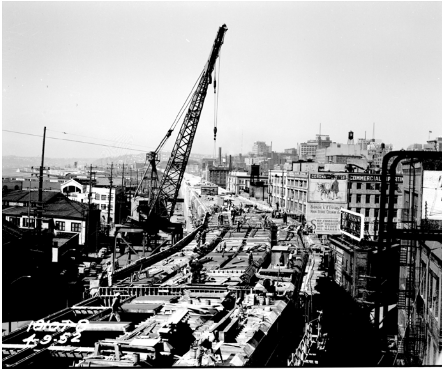
Alaskan Way Viaduct